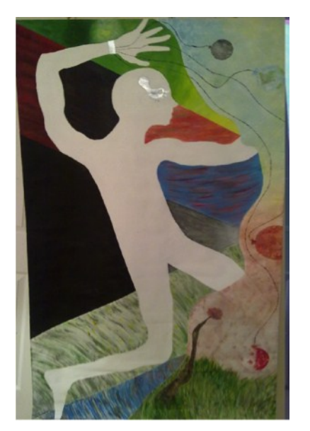
Figure 1. Body Mapping painting: a portfolio representing the growth of a student throughout the semester.

journey to realize a state of being, as well as a desire to contribute to a greater societal good" [8, p.20]. This implies that design activism demands designers to learn, reflect and take on a certain position.