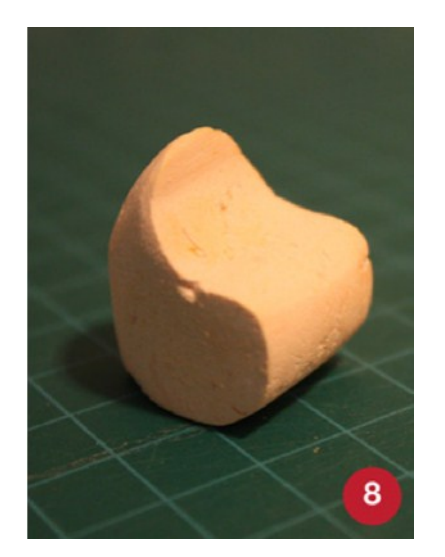
Figure 5. A yam potato used as prototyping material.