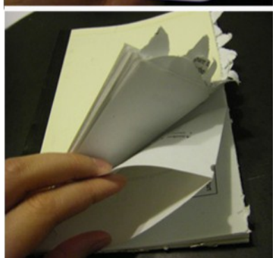
Figure 4. Trace lines connecting repairs and broken parts (top) and a tear book (bottom) showing speculative reframing.

course, more specifically their design decisions in the construction of their project.